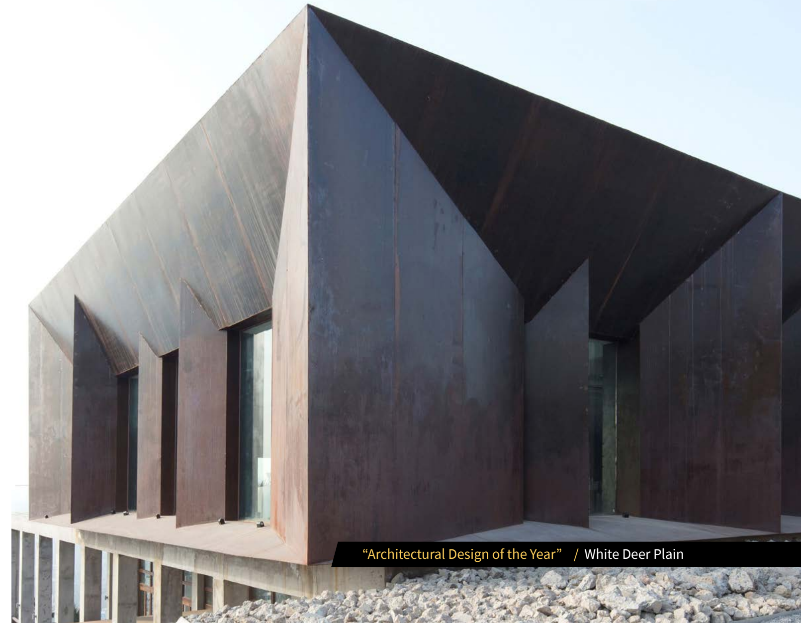
“Architectural Design of the Year” / White Deer Plain

* Subject to changes, please refer to the OPAL website for an updated list of categories.