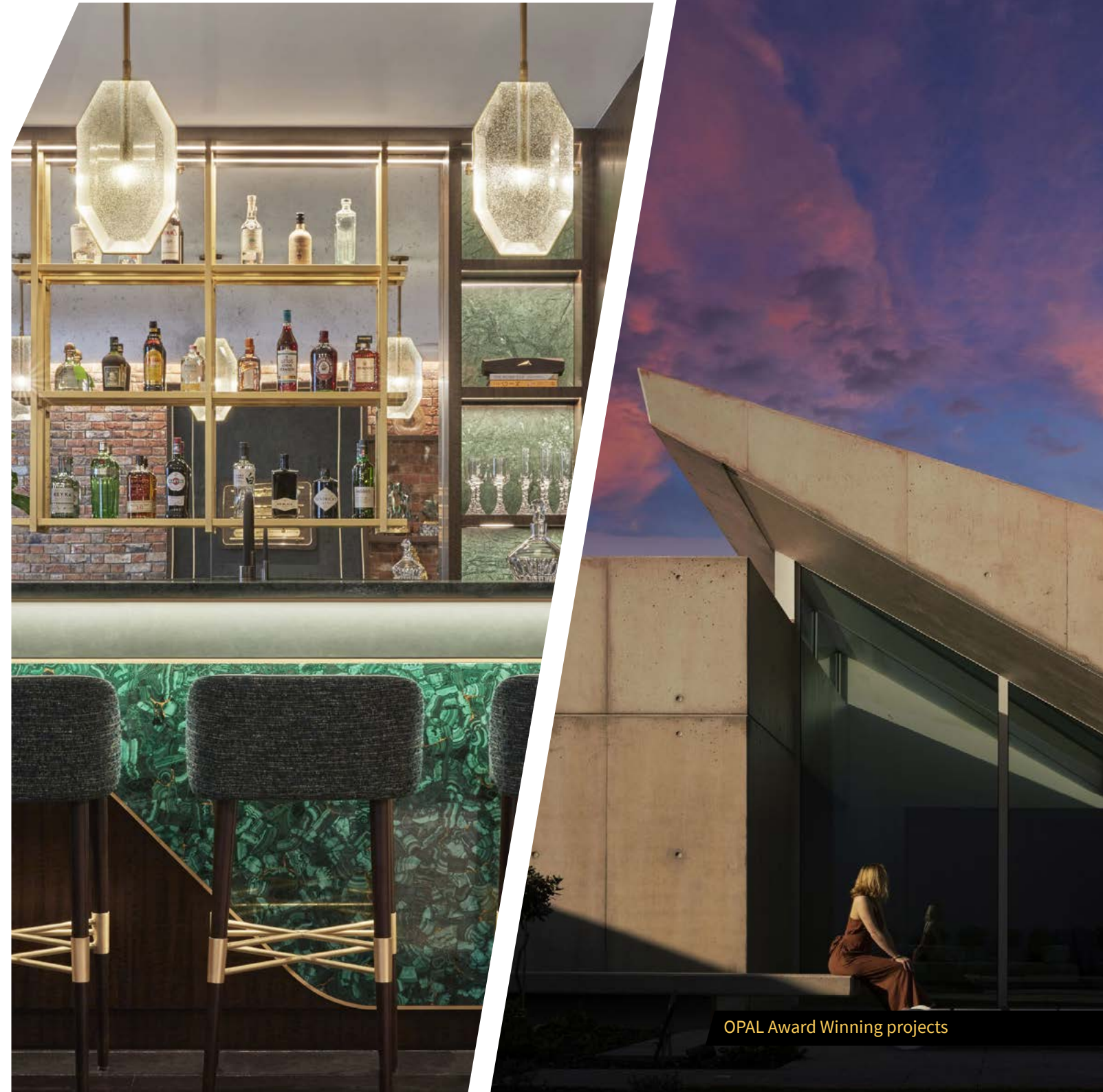
OPAL Award Winning projects