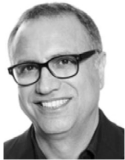
Farmani Group ●●●●●●●●